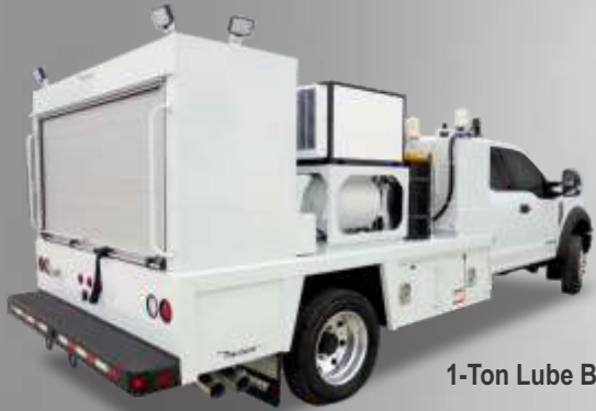
1-Ton Lube Body

Maintainer's NEW LUBE DESIGN saves weight, allowing you to maximize payload and stay ROAD LEGAL