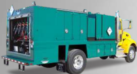
2-Ton Lube Body

Maintainer lube trucks improve SAFETY, ERGONOMICS, & EFFICIENCY!