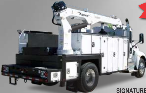
SIGNATURE SERIES 3