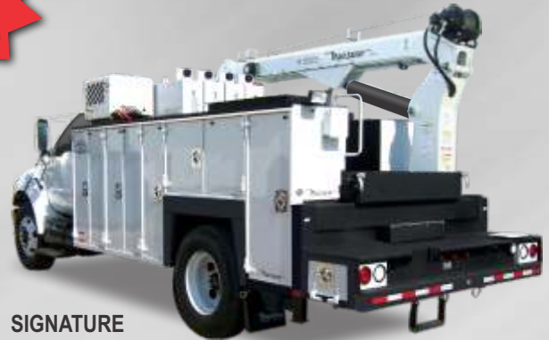
SIGNATURE SERIES 5