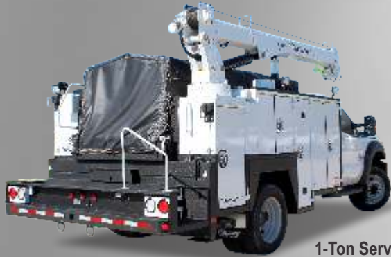
1-Ton Service Body with H6520 Crane

Maintainer service bodies are built to meet the most rugged on/off road conditions