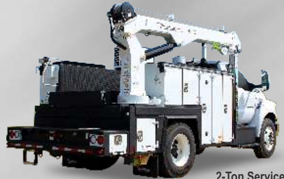
2-Ton Service Body with H10025 Crane