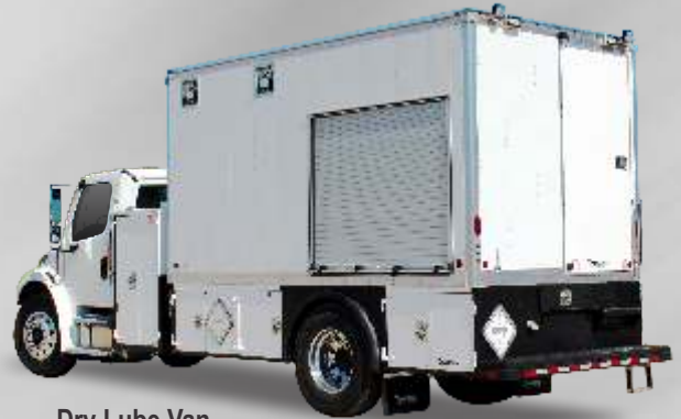
Dry Lube Van

1-TON OR 2-TON BODIES AVAILABLE WITH SINGLE OR TANDEM AXLE