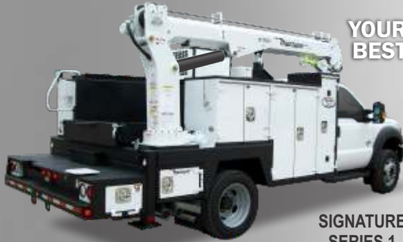
SIGNATURE SERIES 1