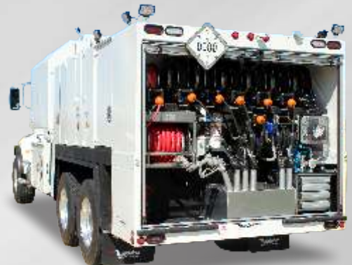
2-Ton Lube with Tandem Axle