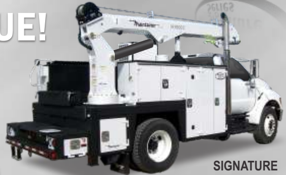
SIGNATURE SERIES 2