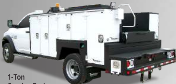
1-Ton Service Body